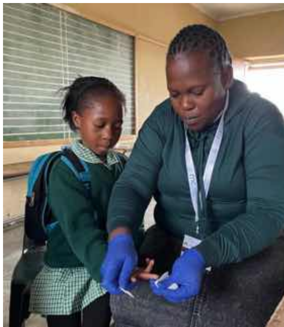
1. Finger prick sample 1

Anthropometric measurements were recorded, and a finger prick sample was taken for determination of the hemoglobin (Hb) concentration. Each child was examined by a Medical Doctor. History of illnesses was recorded. Specifically, caretakers were asked if the child had fever, diarrhea, an upper respiratory infection, vomiting, decreased appetite and/or weight loss. They were also asked if their child received treatment for any condition, and if so, from where. The data of the children are saved and analyzed through the MCC database.