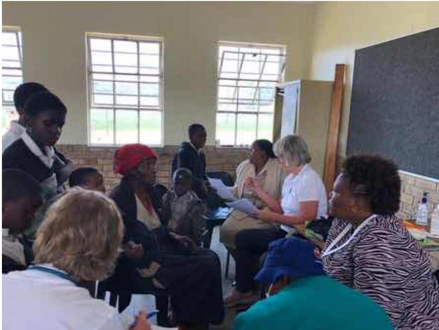
2. Doctor's station 1

At the different locations we checked children who were included in the Children of the Dawn program and great numbers of children from the three main wards. During the mission in Matatiele, MCC saw 887 children in total from different locations. It is notable that the percentage of children of >10 years of age were more prevalent than the mission in 2019. The most important findings are described below. More detailed tables of the findings given can be found in Appendix 1.