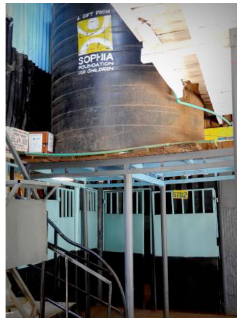
Water tank at Joyspring