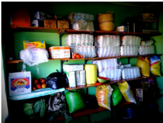
Food stock at the Rescue Home

* Percentages presented of total age group at different locations